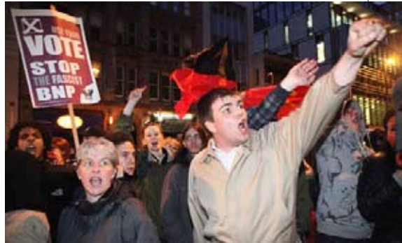
Manchester protest against Nick Griffin.

Mr. Griffin and Mr. Brons are likely to play an important role in any par-